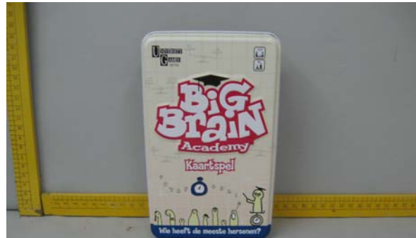
Sample Number (5210)183-0383