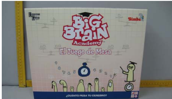
Sample Number (5210)183-0383