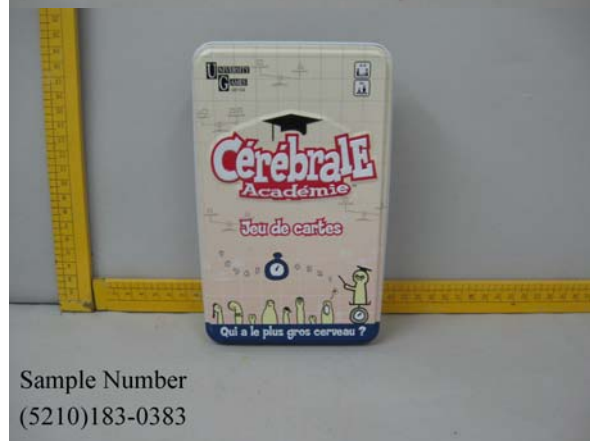
Sample Number (5210)183-0383